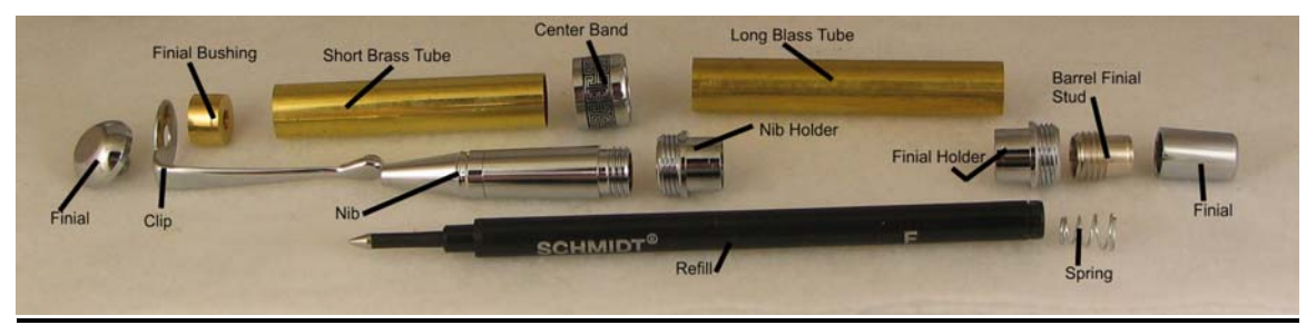
Pen Parts Diagram